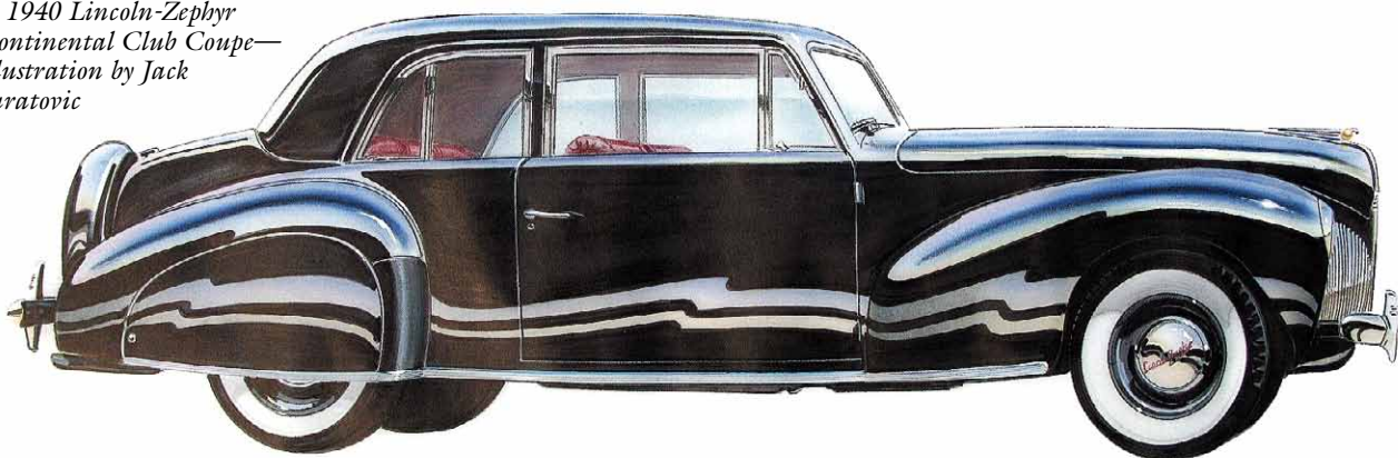
■ 1940 Lincoln-Zephyr Continental Club Coupe— illustration by Jack Juratovic