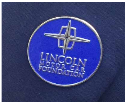
■ An exclusive lapel pin has been designed for major donors to the LMCF.