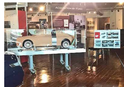
■ The clay model is positioned behind the Lincoln Continental prototype. Next to it is a display explaining the steps in creating the model.