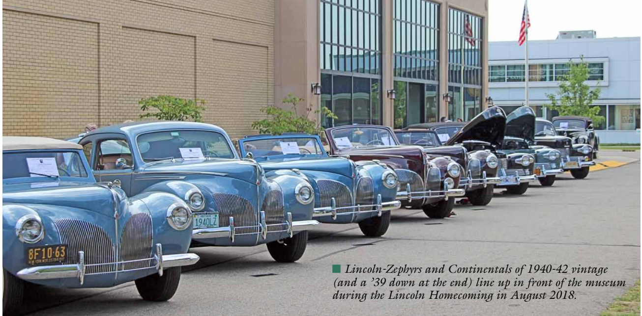
■ Lincoln-Zephyrs and Continentals of 1940-42 vintage (and a '39 down at the end) line up in front of the museum during the Lincoln Homecoming in August 2018.