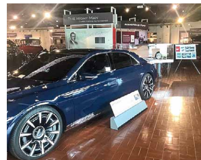
■ The Lincoln Continental prototype on the floor of the Lincoln Motor Car Heritage Museum. The clay model is directly in back of it.